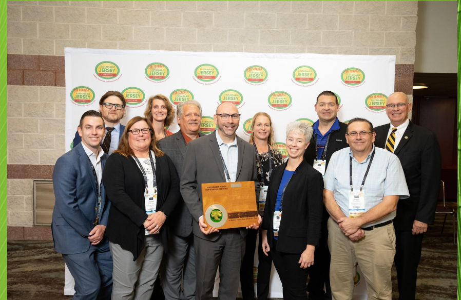
Silver Certification (right)