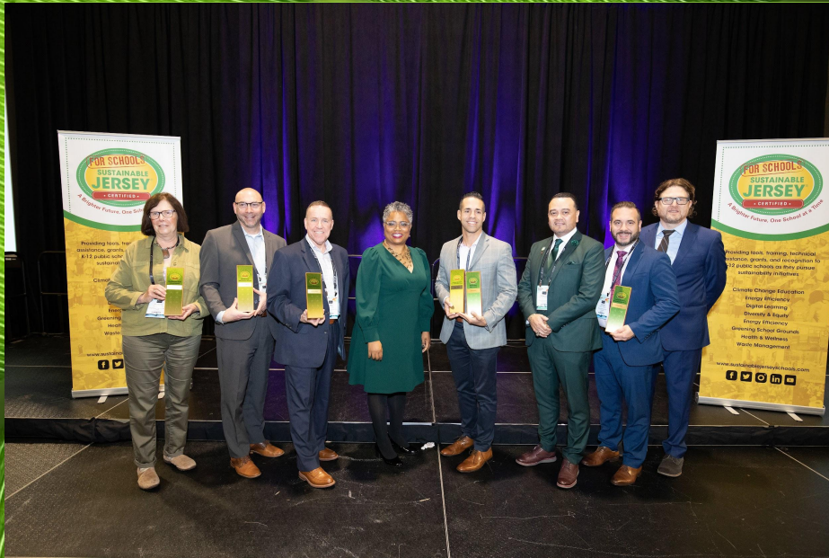
Digital Star Award (left)