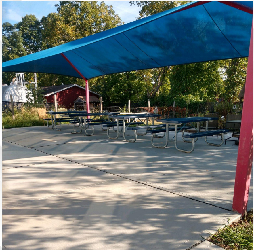
TBS outdoor classroom