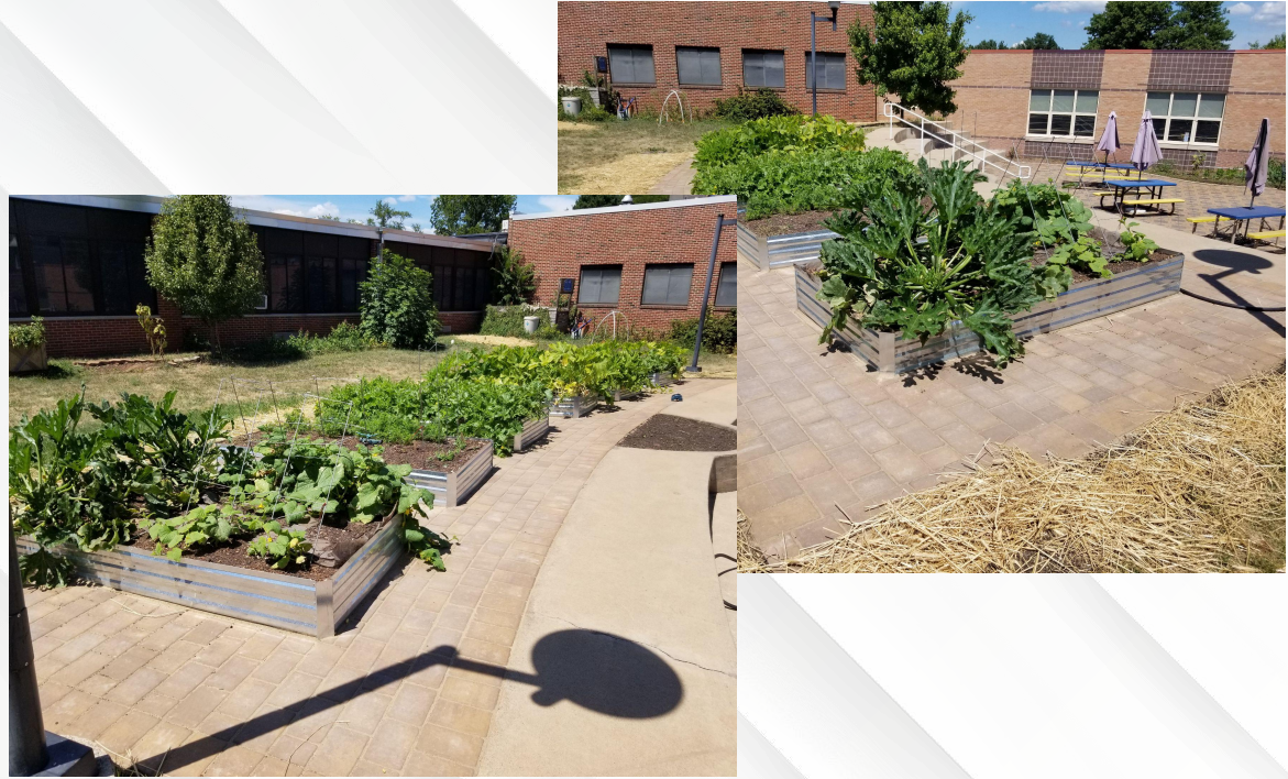
RMS Outdoor Gardens and Pavers