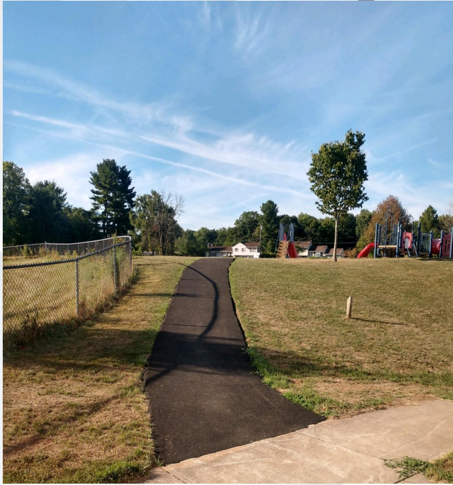
TBS Playground Walkway